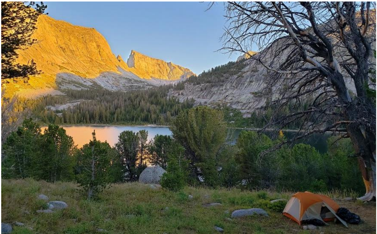
Clear Lake Basecamp at sunset looking south toward East Temple Peak