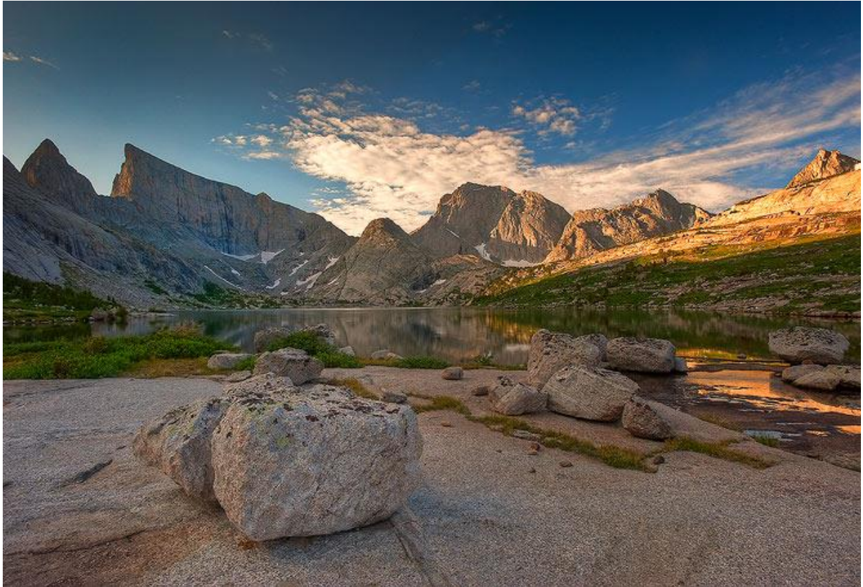
The Hike from Big Sandy Lake to Deep Lake