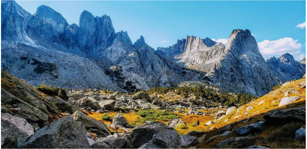
Cirque of the Tower