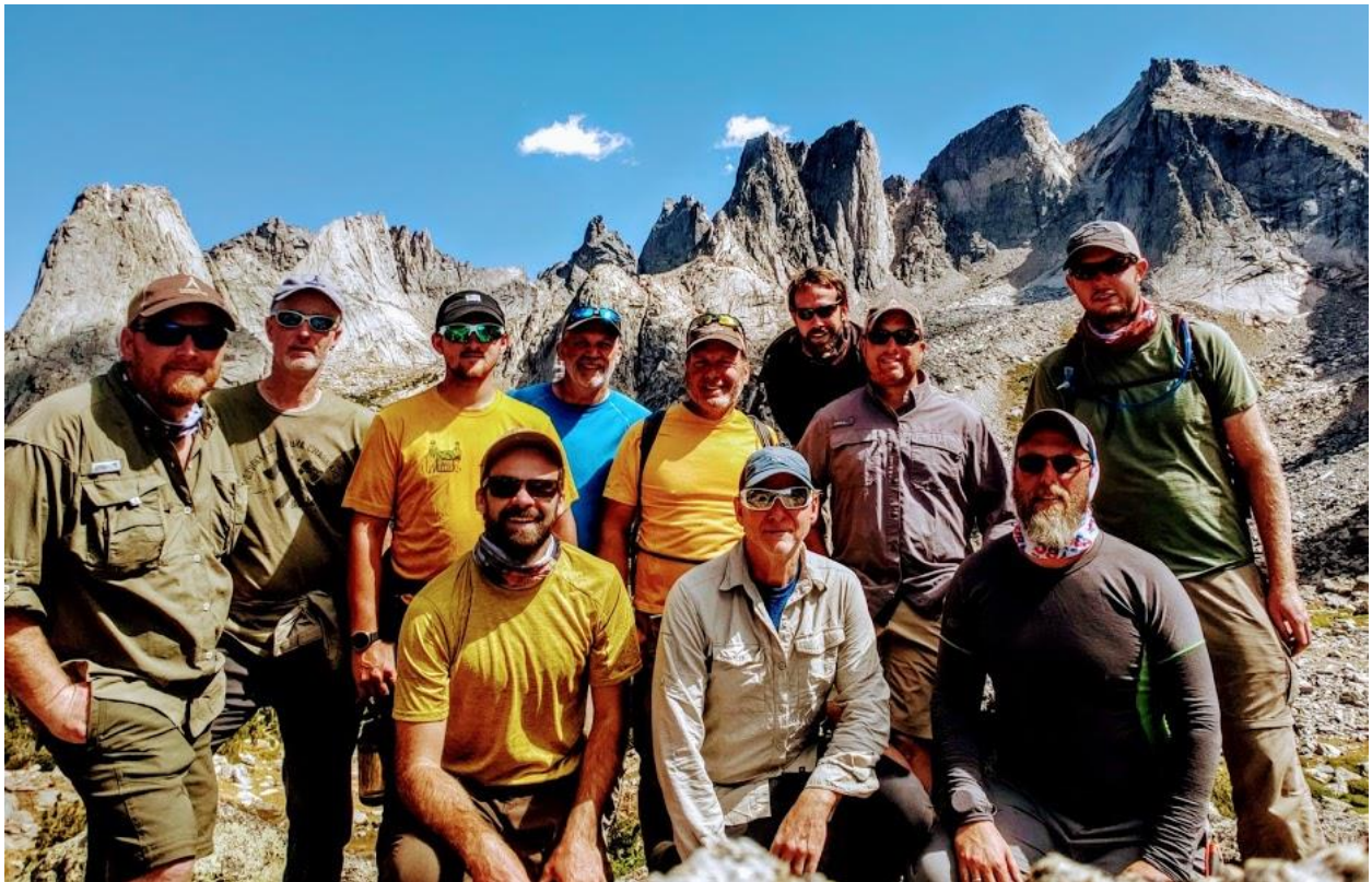
Authentic Manhood Expedition 2020 in the Cirque of the Tower