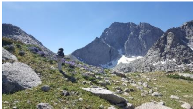
The Climb of East Temple Peak