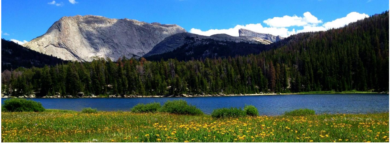
The Hike from Big Sandy Trailhead to Big Sandy Lake

Complete Details of Big Sandy to Clear Lake https://www.mountainproject.com/v/deep-lake-area/105827756